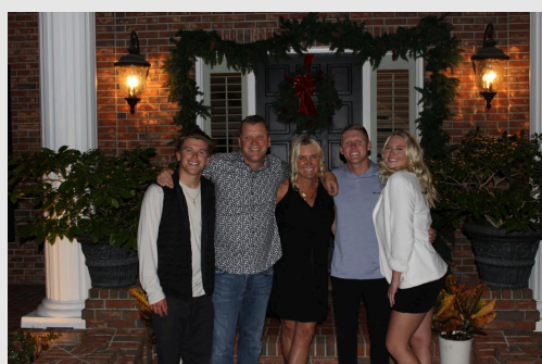
The Decker Family